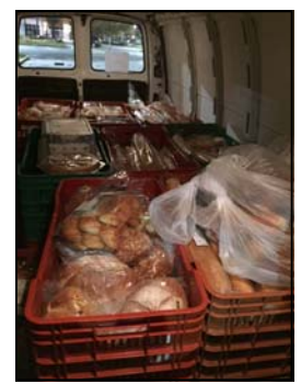
Bread loaded in Van