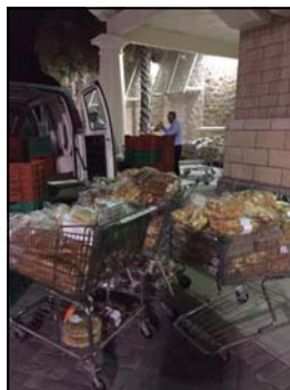
Bread before loading