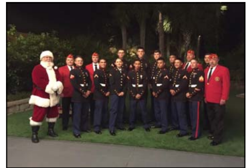
Even a group of Marines representing Toys for Tots showed up for this special event.