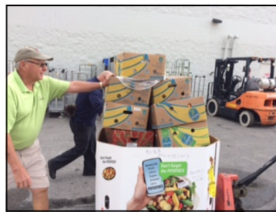
Loading up the van