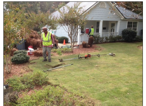
The CSC's landscaping has a new look! Kutters donated the design, materials & labor; Kutters & Craft Farms donated sod.