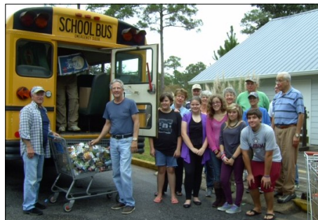
Gulf Shores Middle School students "fill the bus" as a food drive for CSC in November.