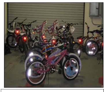
Bikes donated to Christmas Cheer project.

Families entering the Center after December 16th will not be turned